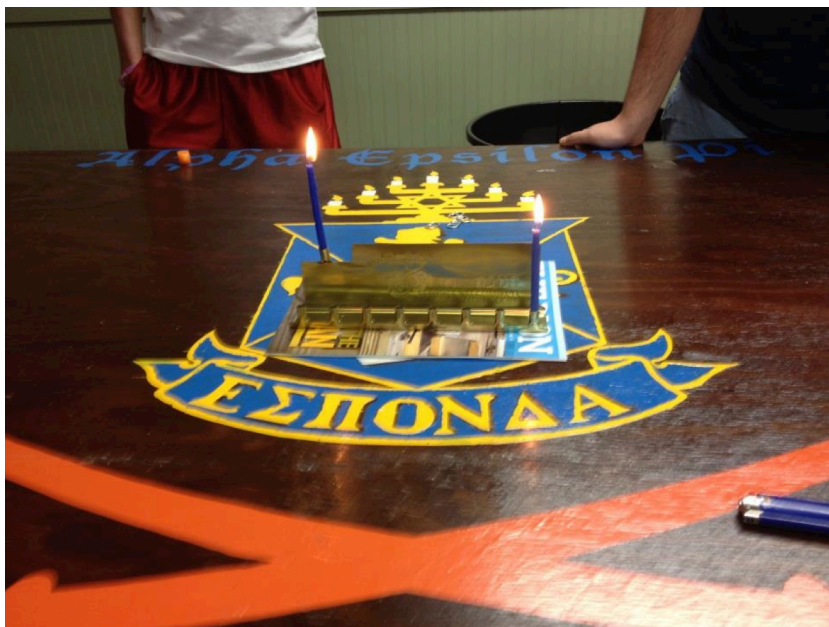
AEPI Celebrates Chanukah