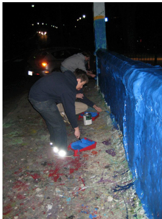
Painting Beta Bridge