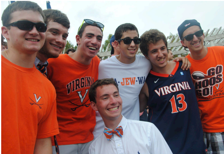
UVA Football game