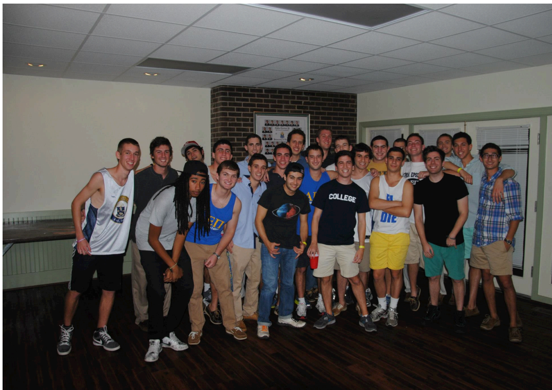
Brothers with Hoodie Allen