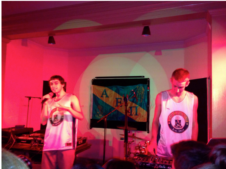
Hoodie Allen Concert